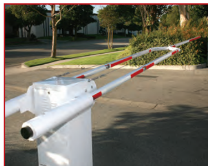
wishbone style aluminum arms up to 27 feet in length and wood arms up to 20 feet in length