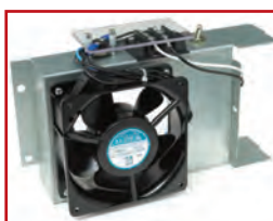
fan/heater kits options available for extreme weather