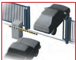
automatic p.a.m.s. sequencing with slide and swing gates