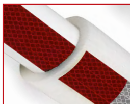
foam padding available for added protection